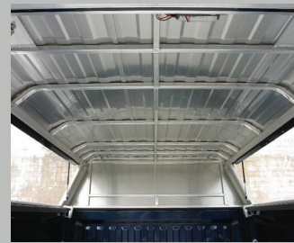
TIG welded Super Cage roof construction