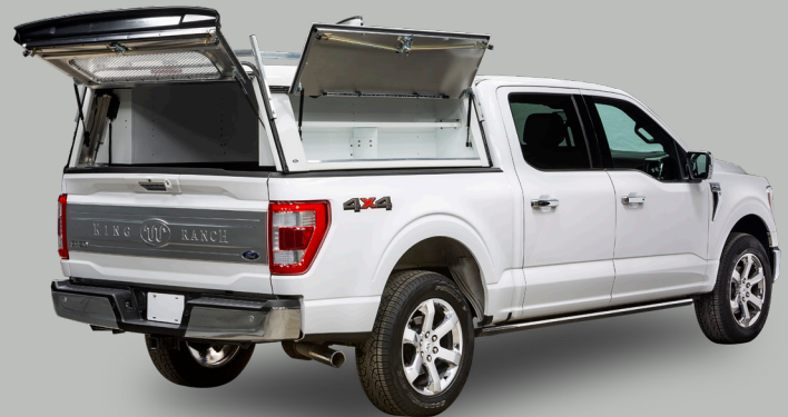
Large side doors for easy access to the toolboxes.